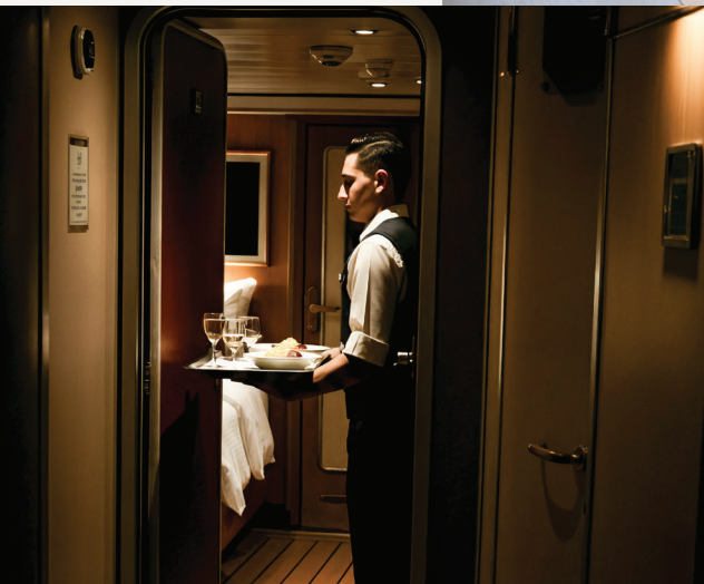
EXPERIENCE 6-STAR SERVICE